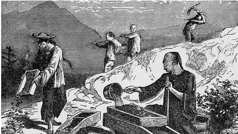
An engraving of Chinese gold-mining in California

By LING WOO LIU Wednesday, Jul. 22, 2009